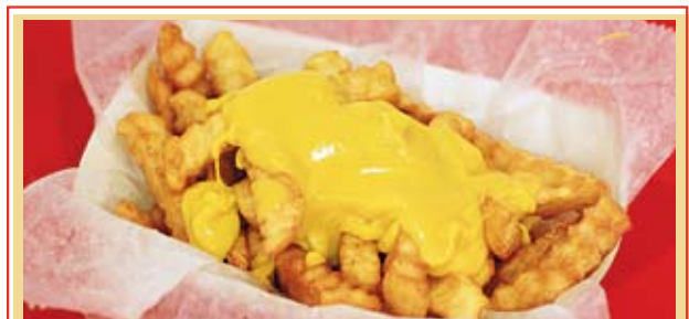
Cheese Fries - Golden Fries with nacho cheese Small 2.85 Large 4.35

Tater Tots - Fluffy inside, crispy outside, a childhood favorite Small 2.35 Large 4.15